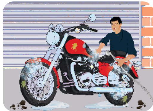
For washing vehicles