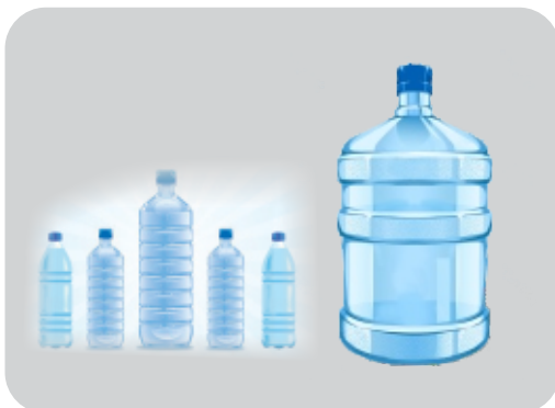
Filtered water bottles