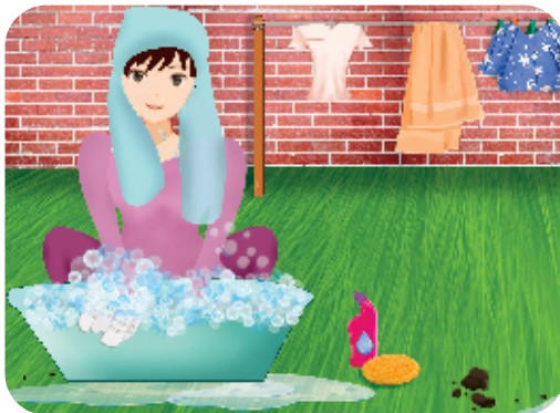
For washing clothes