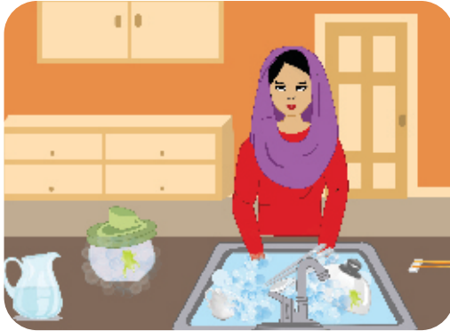
For washing utensils