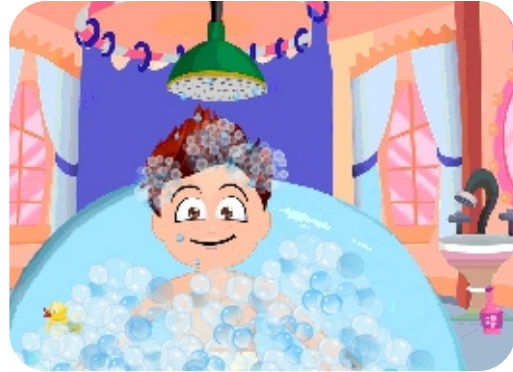
For taking bath